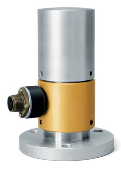
SGMC Includes cap and base.